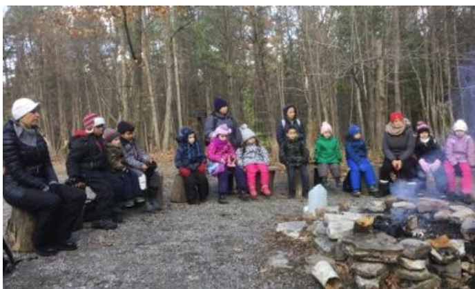
More Forest School pictures of the Kinders